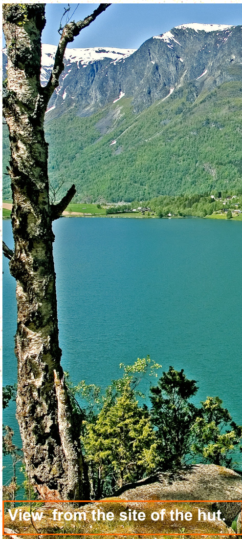
View from the site of the hut.

Text- Photos- Layout: Vatne Vision vatne@post.com